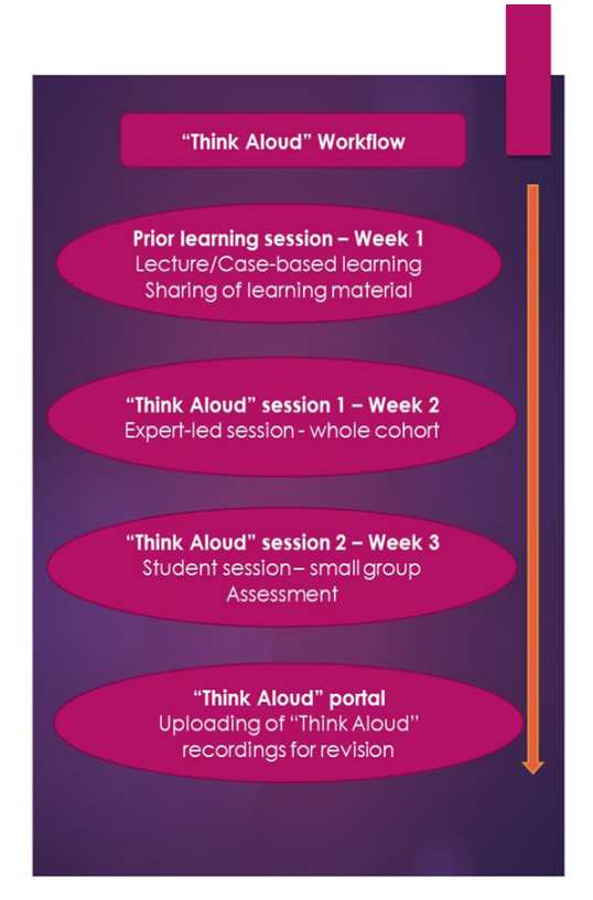
Figure 2: Think aloud workflow.

Regarding the limitations of this study, the inability of the students to provide anonymous feedback may have influenced the overall feedback; however, the provision of neutral responses may have mitigated this to some extent. Another limitation may be that the student performed the think aloud activity for only one step of the procedure. The session was planned in the aforementioned manner after considering the time constraints in allowing all the students to think aloud and the complete procedure. This shortcoming may be overcome by asking the students to record their think aloud sessions individually and submitting it for evaluation. However, even in the current format, the students get a unique opportunity to listen to their peers think aloud, which may facilitate meta-cognitive monitoring and inculcate meta-cognitive control. The activity, which was piloted to support student learning as a quick response to the challenges of the pandemic, enabled