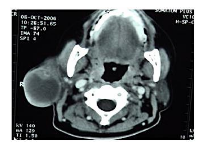
Figure 3: C.T. Scan displayed after the candidate answers the 1<sup>st</sup> question rightly at station No 2.

Examiner as the next step will display the CT scan (see figure 3) if candidate has correctly answered the Q1A and will ask to, 2A ) interpret the CT scan findings to the examiner and 2B ) examiner must take not of comment or no comment on the deep lobe of the parotid gland.