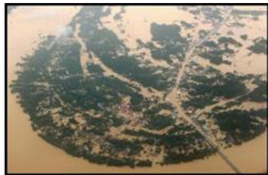
Figure 2. (a) and (b) is the area of Kelantan flood 'Yellow Colored Flood' December 2014 (The Star Online, 2014)