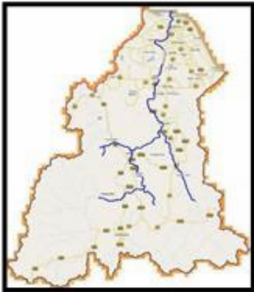
Figure 1. Map of the Kelantan rivers (Laporan Banjir Negeri Kelantan 2014)