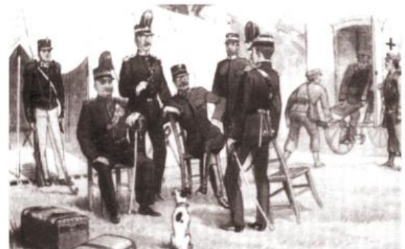
Picture 5: Officers and nurses of Health Department of the Greek Army